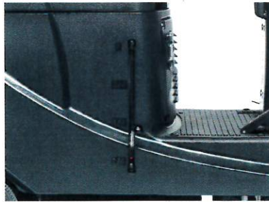
Water solution indicator with volume visible on the tank