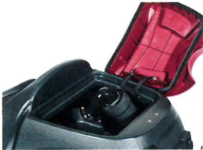
Large opening to the 73 liter recovery tank allows for easy cleaning